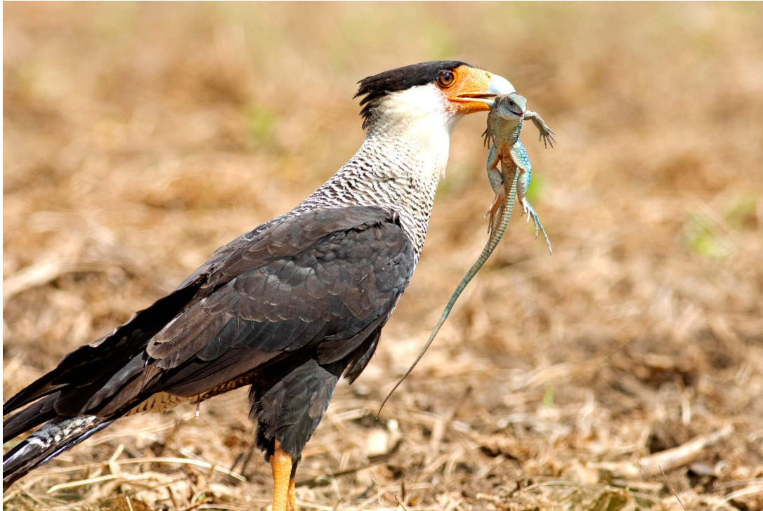
Figure 1. Predation of Ameiva ameiva by Caracara plancus in Belterra, state of Pará, Brazil.