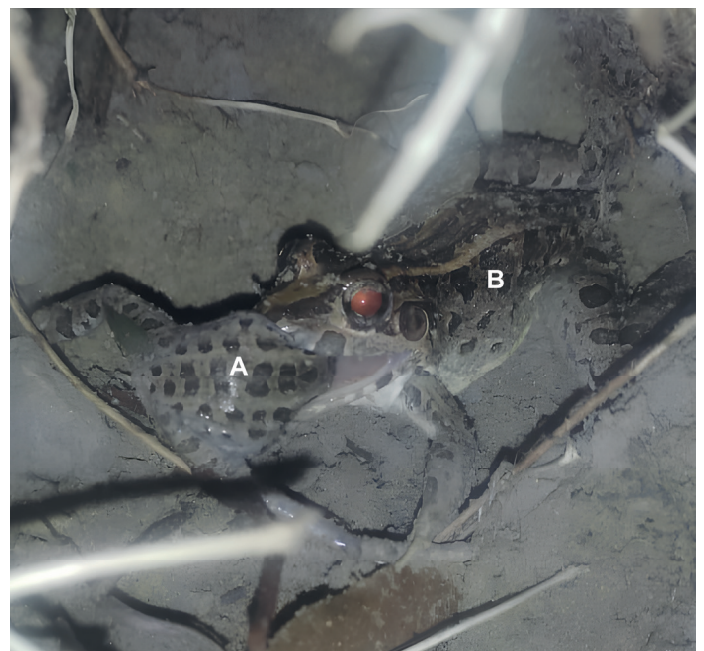
Figure 2. Cannibalistic behavior in Leptodactylus macrosternum in the Pantanal region. (A) Juvenile being preyed upon by an adult (B).