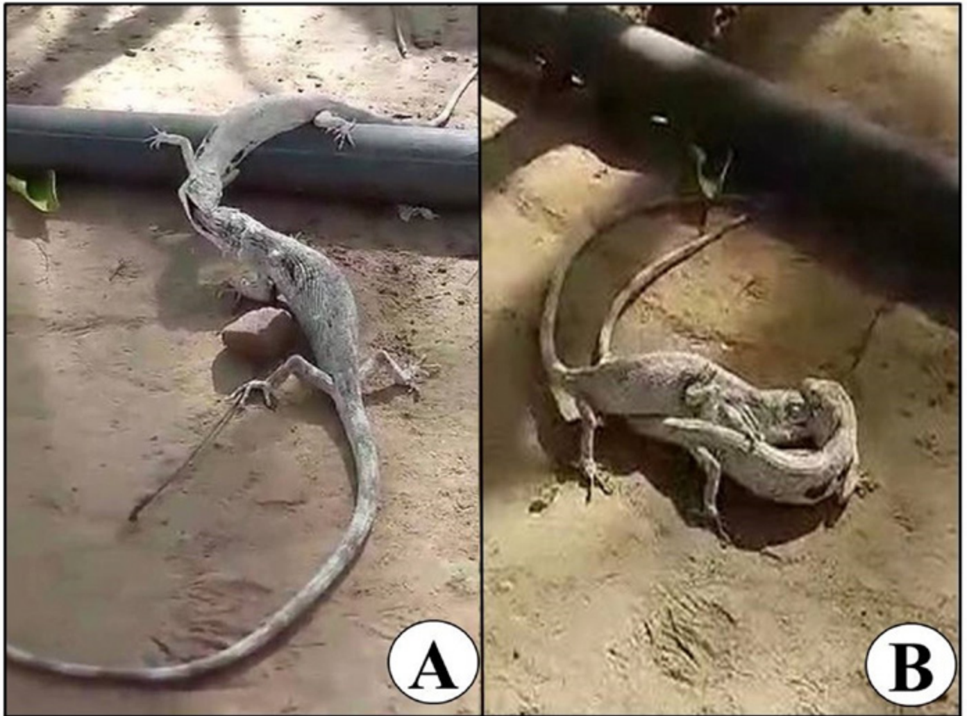
Figure 2. (A) Two adult lizards encountered each other on open ground, and one individual (top) bit the mouth of the other; (B) The attacking lizard (right) stood on the other (left) and continued to bite its mouth and head several times.