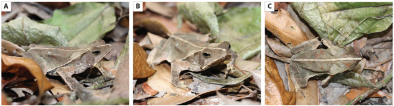
Figure 1. Individual of Rhinella dapsilis from Sete Irmãos Farm, municipality of Cândido Mendes, state of Maranhão, Brazil: (A) Lateral view, (B) Frontal view, and (C) Dorsal view.