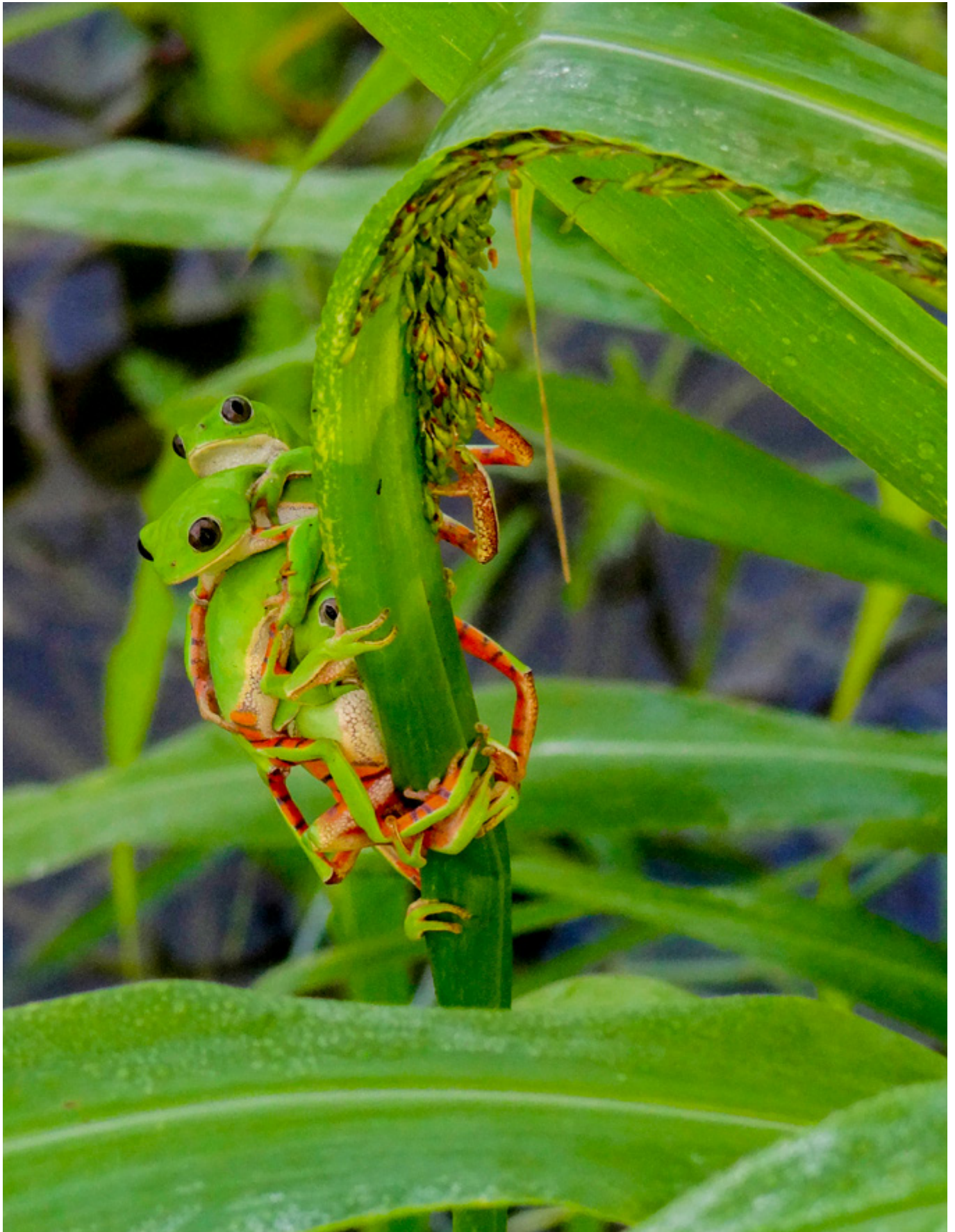
Pithecopus gonzagai Groáiras, CE