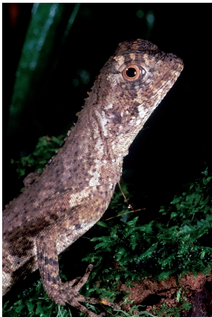
Uranoscodon superciliaris , Oriximiná, PA - Foto: Magno Segalla.