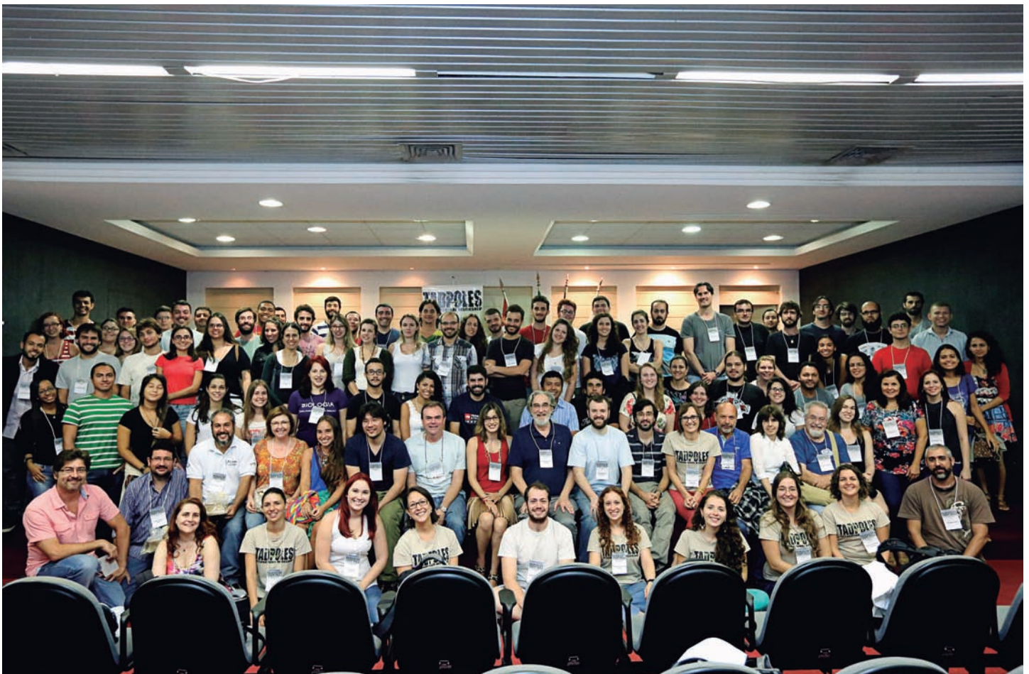
Attendees of the first “Tadpoles International Workshop”, held in 16 and 17 March, 2015, at the UNESP, São José do Rio Preto, SP, Brazil.

Although tadpoles of different species are often categorized by ecomorphological type (McDiarmid & Altig, 1999), this classificatory scheme is not particularly refined and is based on rather limited ecological data, such as whether the tadpoles are found on the bottom or in the water column of a pond. Tadpoles of too many species fall into the same ecomorphological type. This gives us little understanding about how tadpole of different species partitioning the aquatic environment. More needs to be done to understand tadpole behavioral ecology in the field. For this to happen, we need to know more about the fundamental natural history of tadpoles. For example, we cannot continue to assume that where tadpoles are found in a