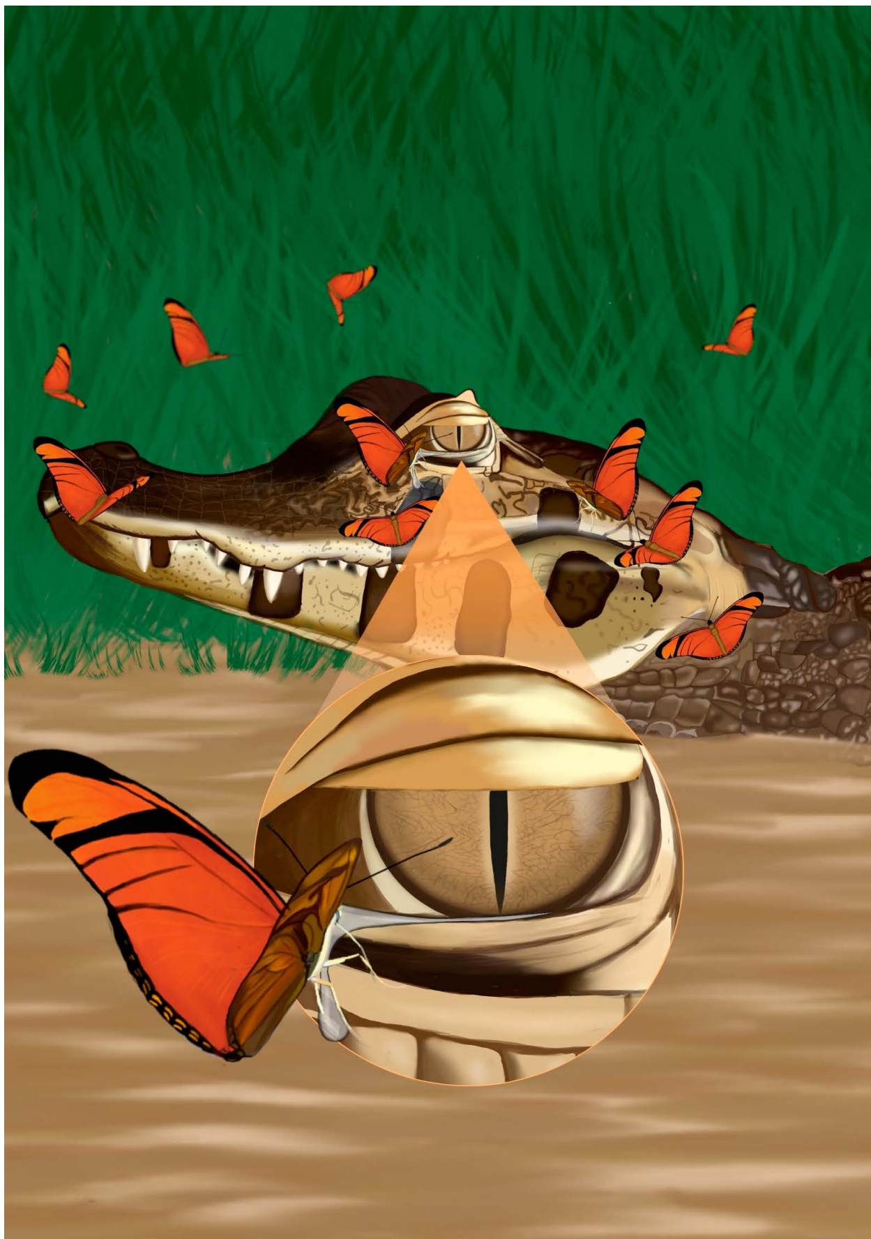
Ilustração Digital Alizée Thomas - @at_illustrations_ Caiman yacare